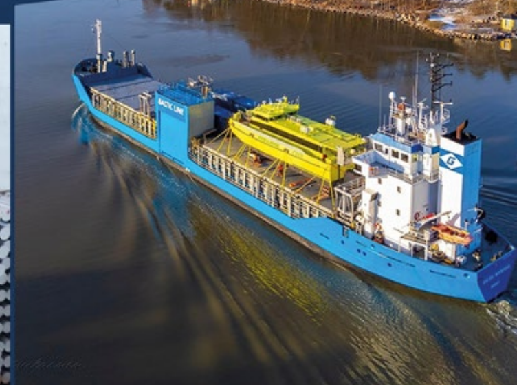
Unitized cargo via sideport